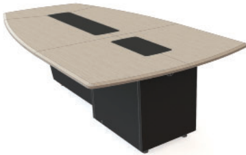
Code T3600 Basic (36FR + 36RR Sections)